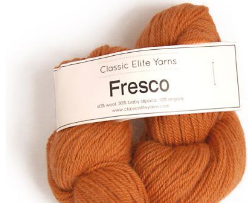
Classic Elite Yarns

I just finished a cowl in the Mountain Colors River Twist and I love it. The colors are vibrant and unexpected. I have used some of this yarn and CEY Fresco to make some matching fingerless mitts. It is a simple fair isle pattern from Drops . It was fun to do and in just a little bit of time I have a nice set for spring. Stop in to see the other colors and pick out a small accessory piece to knit for spring. I always need something around my neck in spring with the brisk winds but I like something different that doesn't remind me of the winter I am trying to forget.