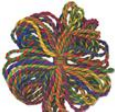
Mountain Colors River Twist