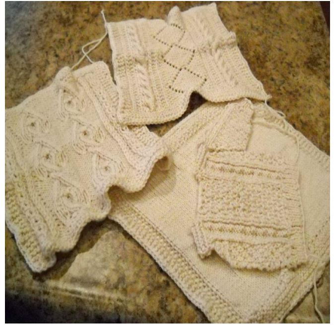
Janet W's blocks

Our Afghanalong class times are established