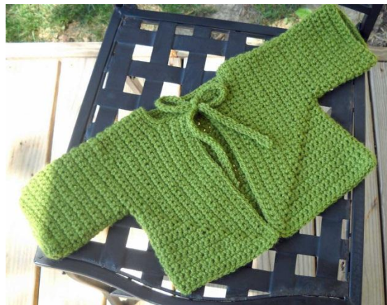
Crochet version of the Elizabeth Zimmerman's Baby Surprise Jacket

If you are considering taking the Felted Granny Square Bag class and don't know how to crochet, you will need to take the Crochet Skills class before tackling the bag class later!